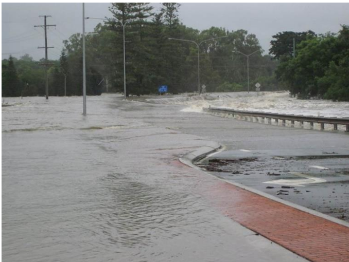
North Pine River at Gympie Road January 2011

Remember that although very large floods are unlikely, it is important that you are aware they can occur so you can plan for your safety.