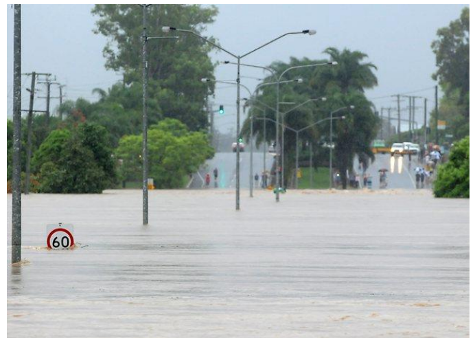
Caboolture River at Morayfield Road January 2011

For those areas where the flood or storm tide information is considered to have a lower reliability a note is added to the reports of the affected properties. The areas of reduced data reliability are also shown with shading on the report maps.