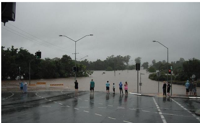
Caboolture River at Morayfield Road January 2011

Council's flood data is subject to regular reviews and updates, which can result in changes to the flood information provided for the property you are interested in. Council recommends that you periodically check back on Council's website to get an updated report.