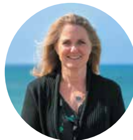
Kerry Street Weekend Receptionist