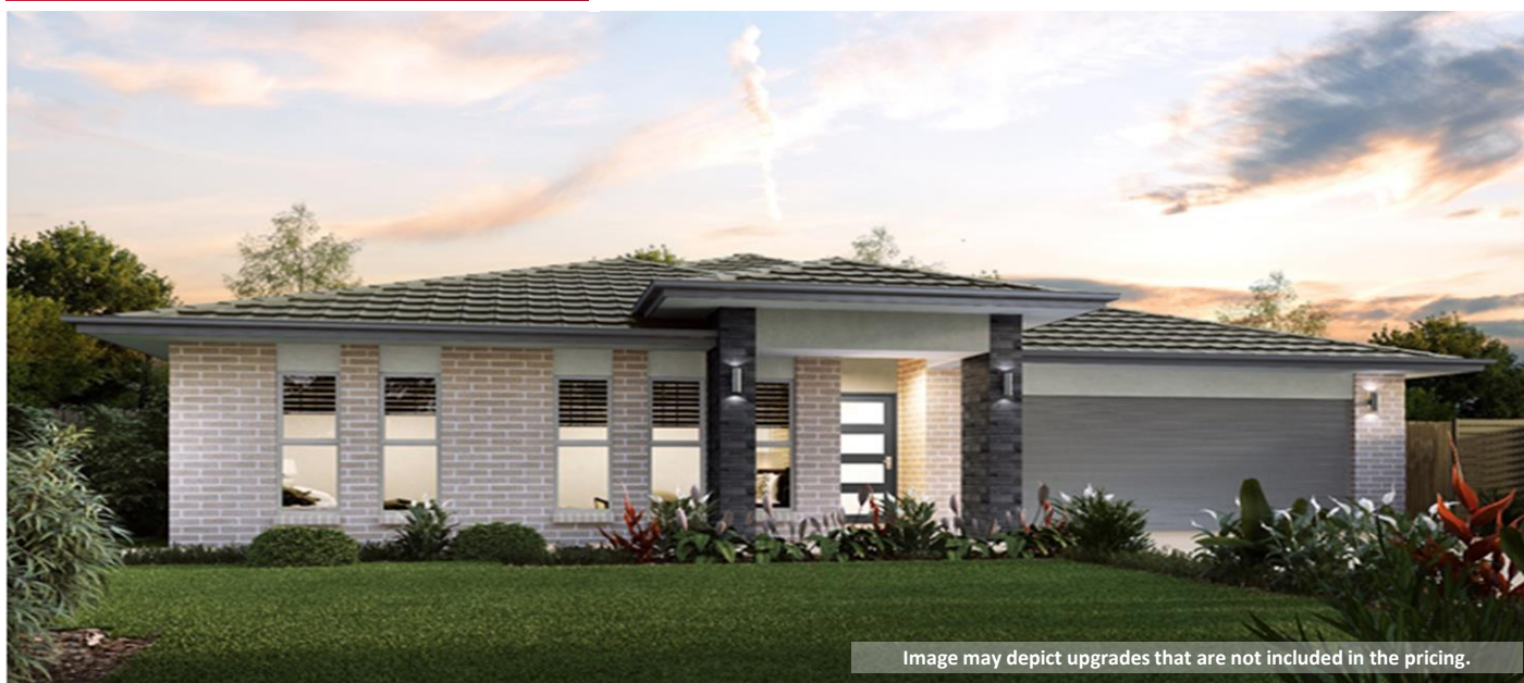
Image may depict upgrades that are not included in the pricing.

Floor area: 285.35m 2 / 30.72sq | Block size: 1500m 2 Address: Lot 604 Lomond Street, Louth Park